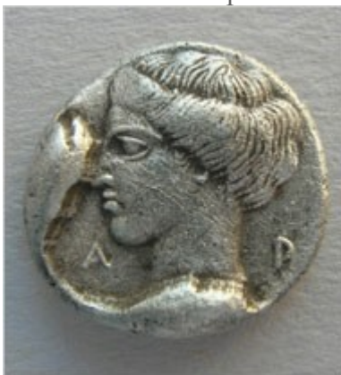
LONG LOST Silver coin, circa 430 B.C., found in the altar trench at Mount Lykaion in Arcadia. It depicts Artemis or Despoina.