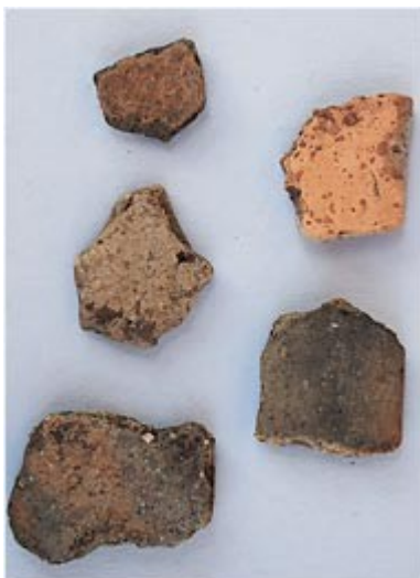
University of Pennsylvania Museum of Archaeology and Anthropology Potsherds from the pre-Greek civilization that worshiped an unknown deity there.